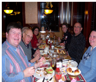
Holiday Dinner 2010

hope enough of us will be able to participate and hold a Field Day this year, I would expect our August dinner gathering will happen at the Atlanta Bread Café. I've always wanted to go tour the Battleship New Jersey and have a look at the ham radio station there too. I am going to look into a possible club trip in July, if there is an interest, since we do not usually have a meeting in July.