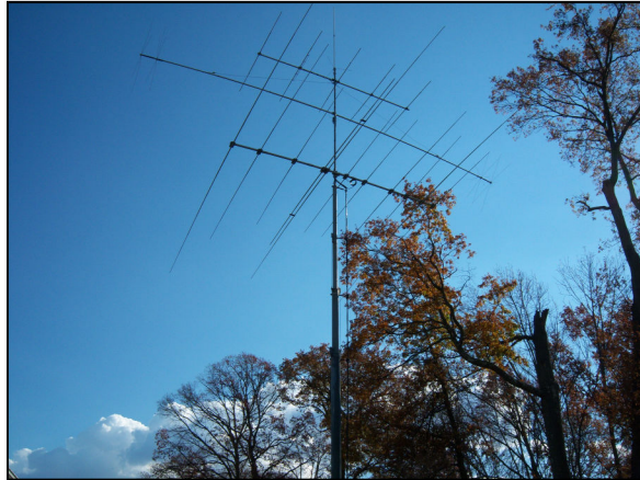
But when one tower just isn't enough