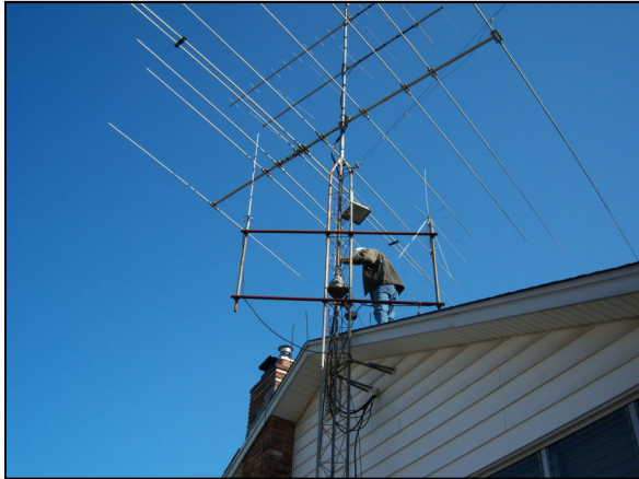
One nice antenna farm

The January and February meetings are the 4th Monday due to holidays