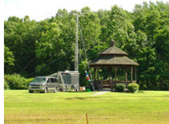
Field Day 2004

As of right now we plan on having two stations (Class 2A) operational this Field Day. A Phone/RTTY station and a CW station. We will be back at Bee Meadow Park the same site where we have been for the last two years. Even if you can't find time to operate we always need extra hands for setup and take down. The setup time will be decided at Monday's meeting and will be in a special Field Day email on Friday night. Take down will be at the end of Field Day at 1800Z (2PM) on Sunday June 26. At Monday's meeting we will set the times and review the logging software and the rigs that we will be using. Come on out and have some fun. This is the only time that some of you get on the low bands and this year there are sun spots. There will be control operators here so that people with any (or no) class of license can operate. This year because of other commitments the Field Day results will not be available until after the 4th of July.