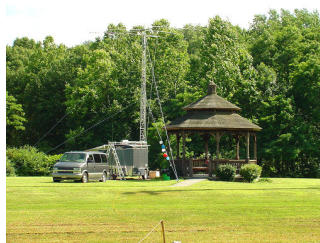
Field Day 2004